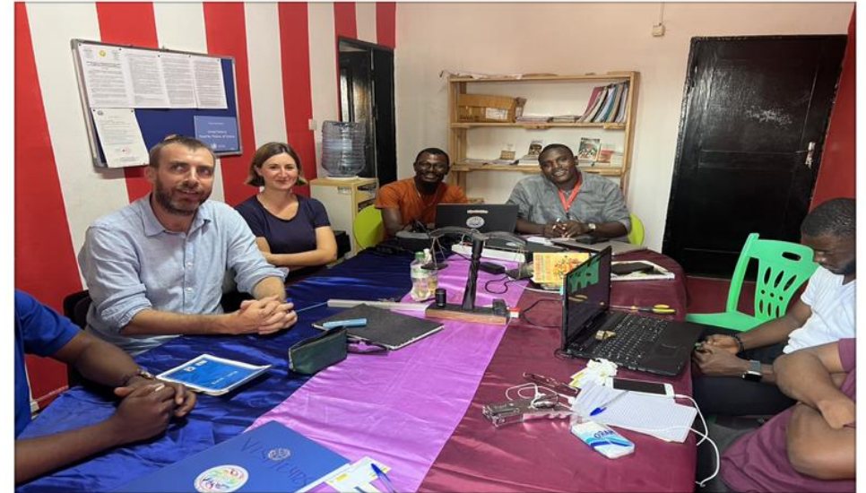
Working meeting with Amnesty reporters