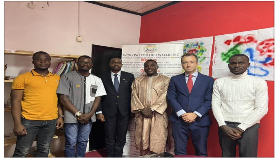
Visit of the UK Deputy